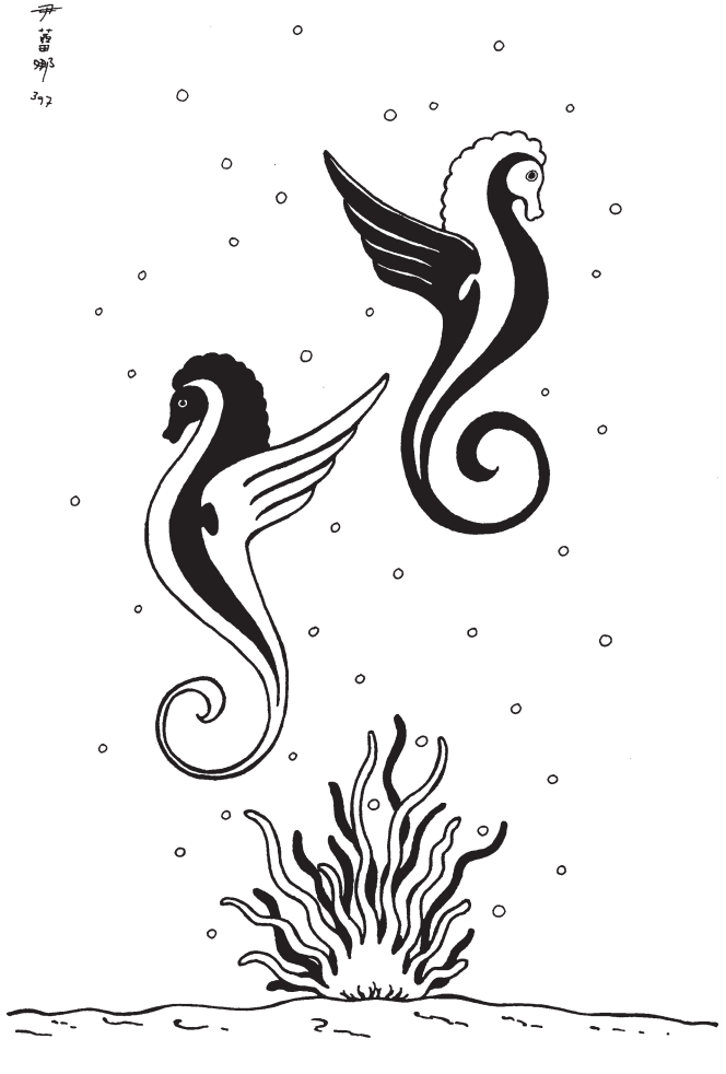
ConJosé Progress Report 3

This list is subject to change due to time and timing. Check our web site for further updates.